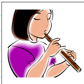
Tin Whistle with Martina French

2 nd class Second class have been very busy learning lots of new things including how to make paper and how to do